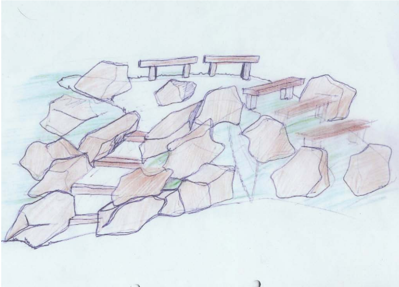
SKETCH OF OPTION A FOR PROPOSED TRIALS BIKE AREA BY MEMBERS OF TRIALS BIKE CLUB