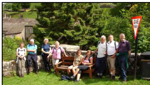
The walking group on a recent walk

The group has been going for three years now and has a membership of 10. The average number walking is 6/8. We meet each Monday at 9.30am at Steeton Hall car park to drive, walk or take public transport to begin our walks. We are a group of mixed ages and enjoy varied company, always have fun and are very enthusiastic and all have roles to play. Our walks are arranged in advance but are always subject to change, taking account of conditions, weather etc. Favourites are river walks and are usually between 5 and 6 miles but we are always ready to change things to meet any special needs. Shorter walks on flat ground are no problem (we don't do "big hills"). We are lucky to have beautiful countryside on our doorstep - Bolton Abbey and the Dales are great favourites. Two men from Keighley have joined us recently (our fame is spreading) and one member who moved away travels 1 hour each Monday to be with us! Please come along with a packed lunch and suitable clothing and footwear for all weathers!