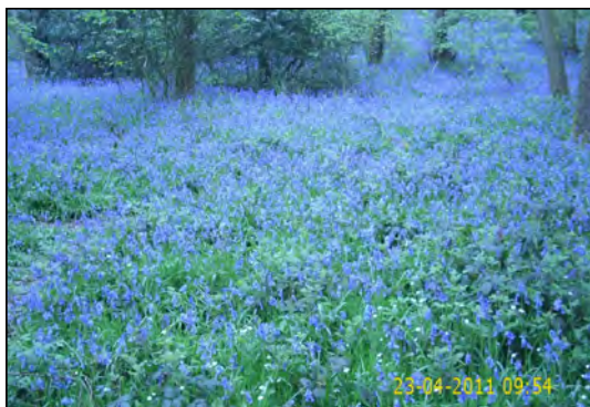
Bluebell Wood.